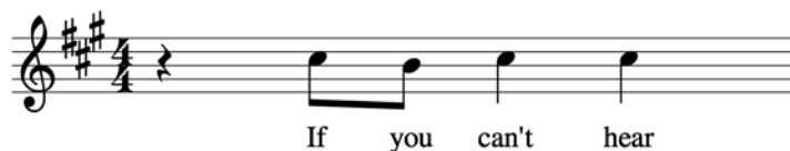
Theme X in “Blurred Lines”