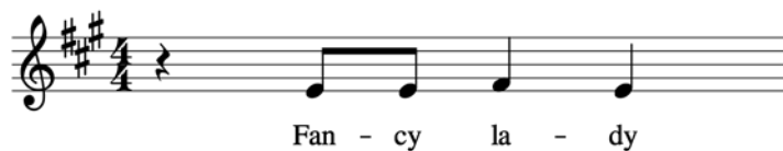
Theme X in “Got to Give It Up”

Theme X refers to another four-note melodic sequence. In the deposit copy, Theme X is sung to the lyrics “Fancy lady.” In “Blurred Lines,” it is first sung to the lyrics “If you can’t hear.” Like the Hook Phrase, Theme X is both unprotectable and objectively dissimilar in the two songs.