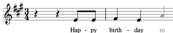
Theme X in “Happy Birthday to You”

The pitches and rhythm of Theme X in the deposit copy are identical to those sung to “Happy Birthday” and numerous other songs. None of the Theme X pitches in the